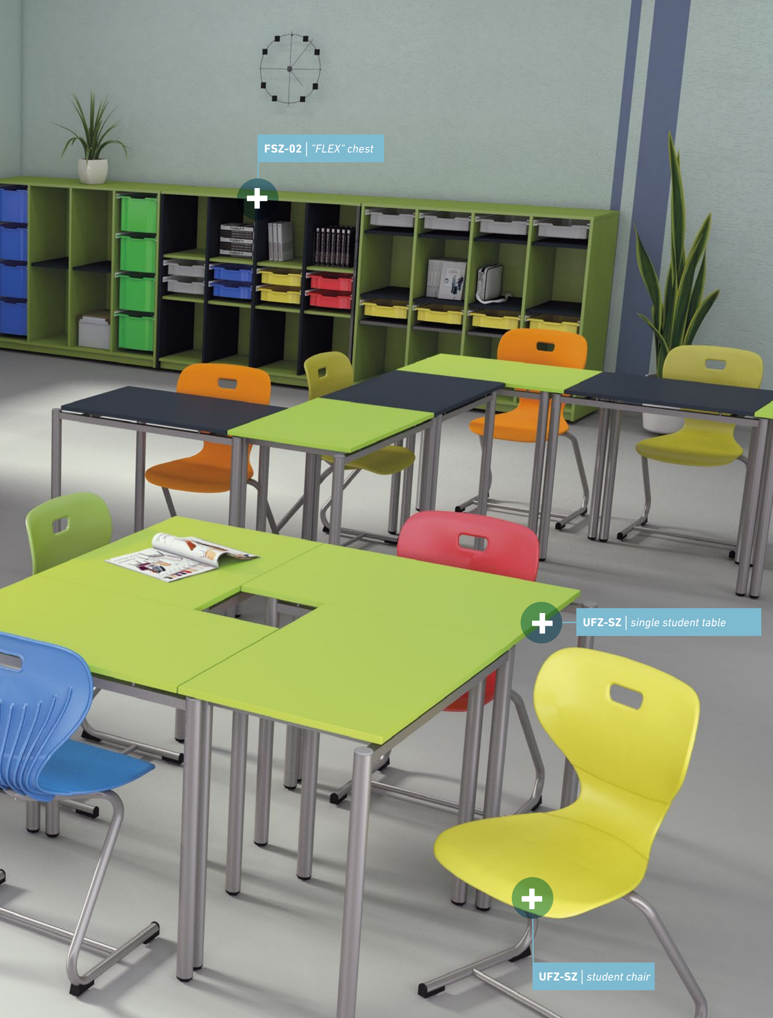
FSZ-02 | "FLEX" chest