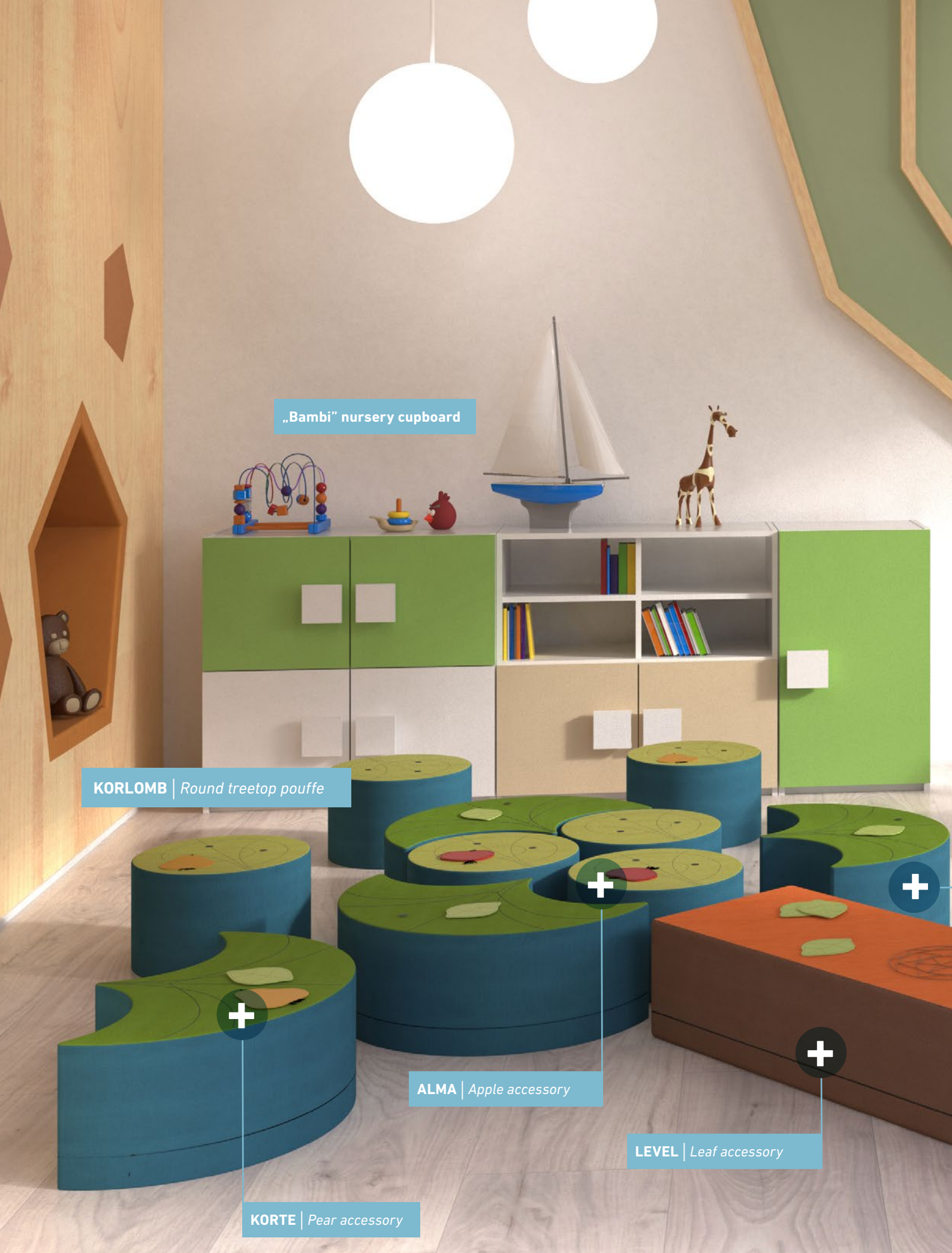
„Bambi” nursery cupboard