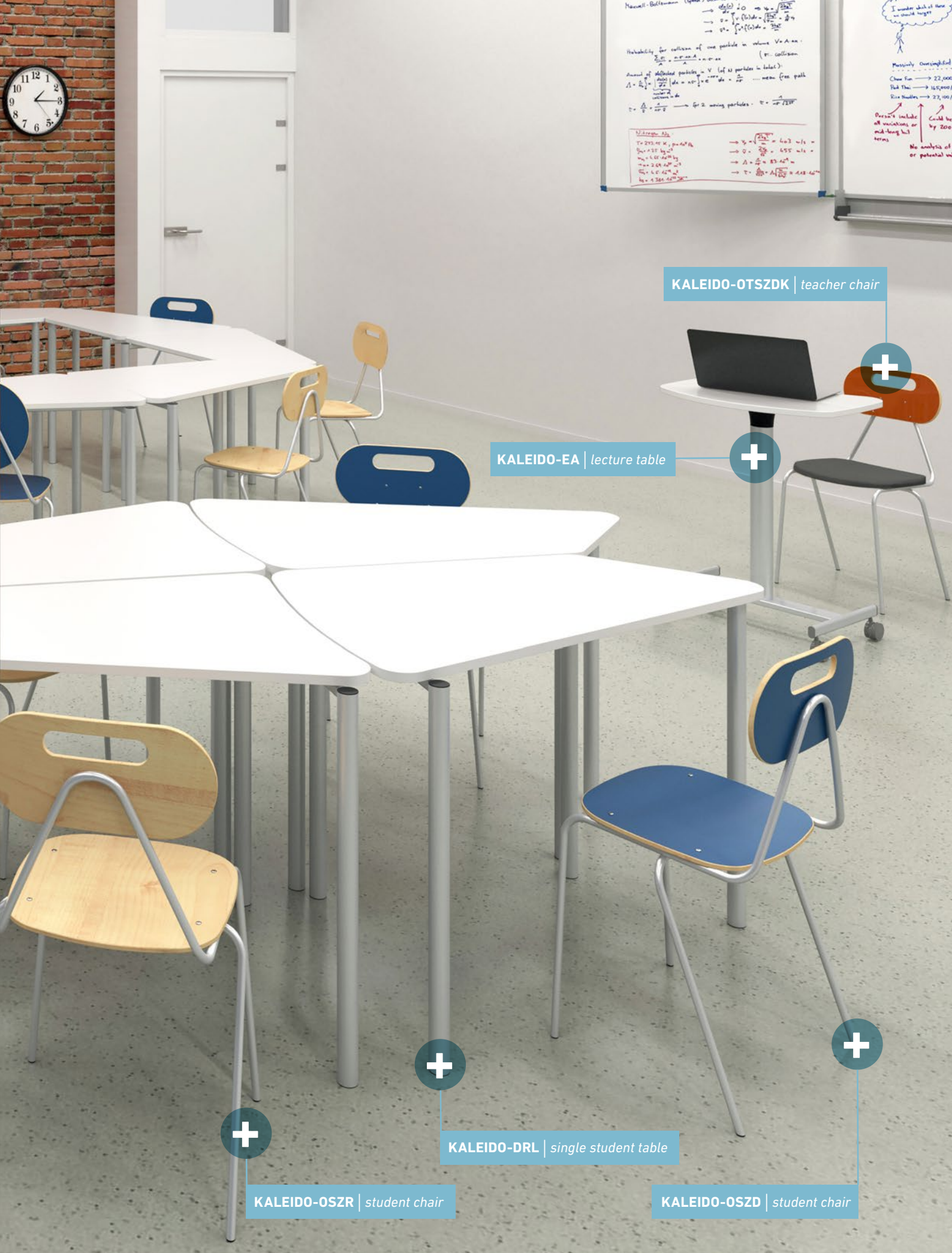
KALEIDO-OTSZDK | teacher chair