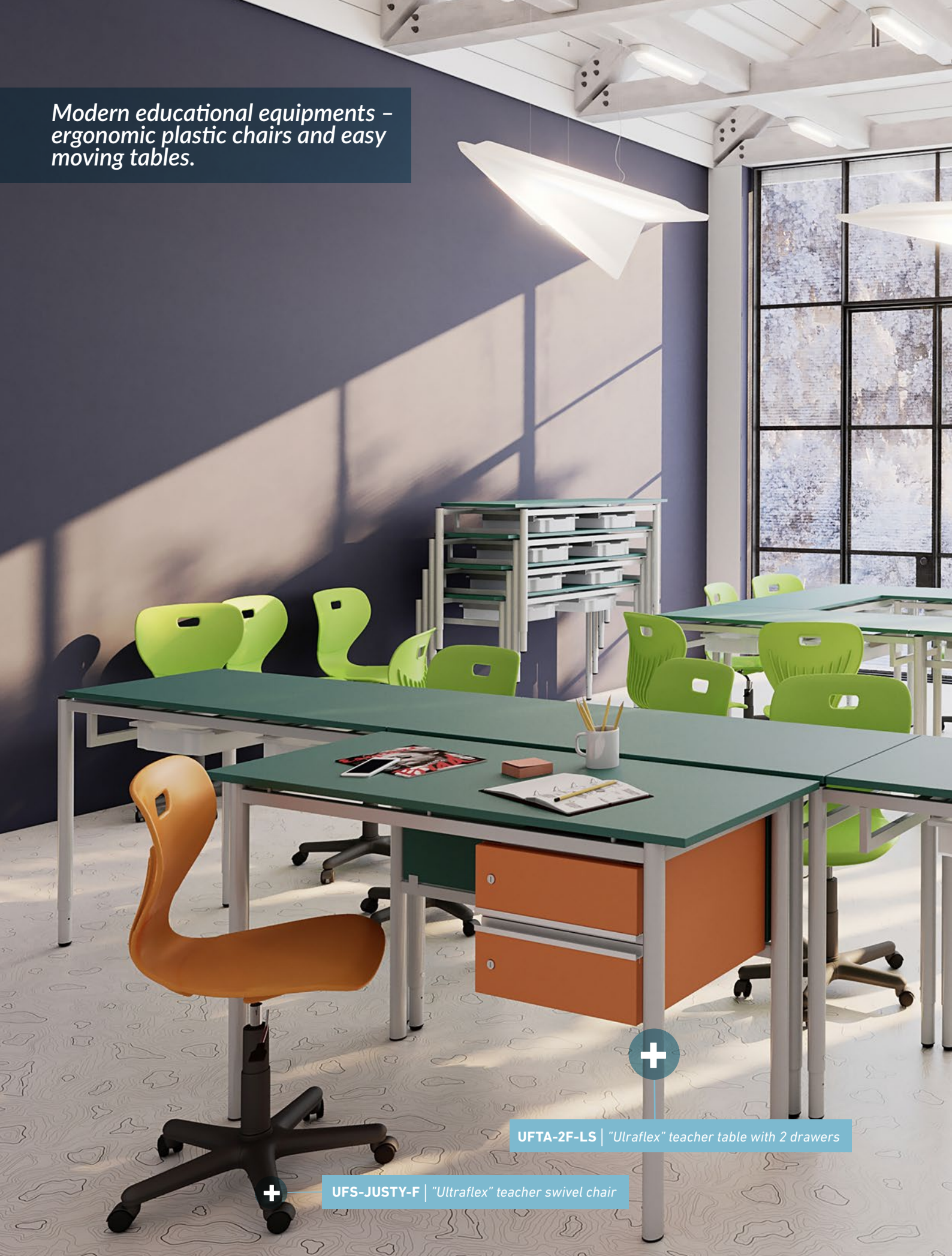
UFTA-2F-LS | "Ultraflex" teacher table with 2 drawers

Modern educational equipments - ergonomic plastic chairs and easy moving tables.